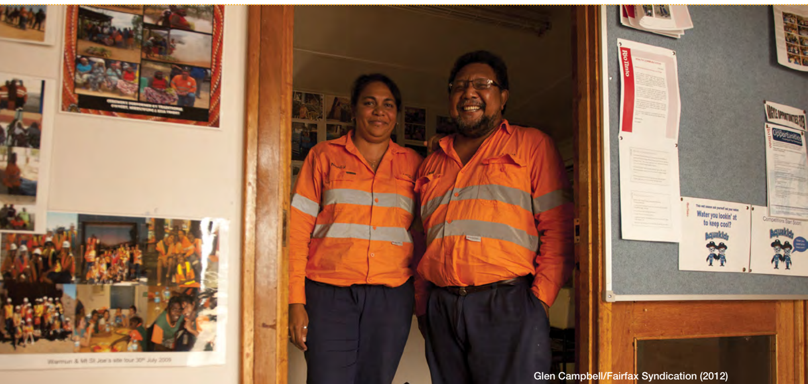
Glen Campbell/Fairfax Syndication (2012)

New South Wales is the only jurisdiction that does not have a clear special measures provision in its discrimination legislation. Therefore an employer wanting to conduct a targeted recruitment strategy for Aboriginal and Torres Strait Islander people in NSW must apply for an exemption from the Anti-Discrimination Act 1977 (NSW) (the NSW Act) . The only exception to this is if being of a particular race or ethnic background is a 'genuine occupational requirement' for the position advertised and the employment involves one or more of the circumstances set out in s 14 of the NSW Act.