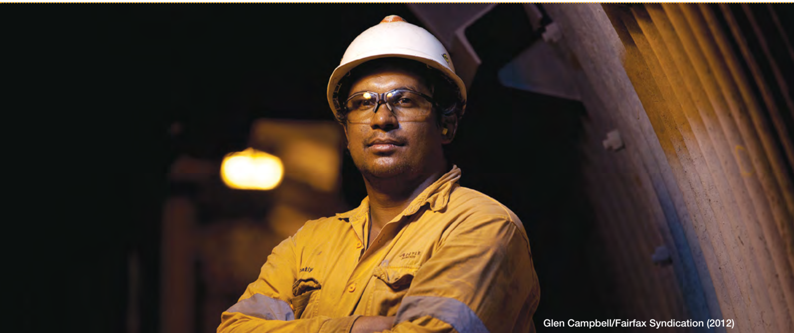
Glen Campbell/Fairfax Syndication (2012)